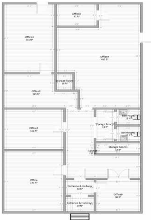
Ground Floor Office